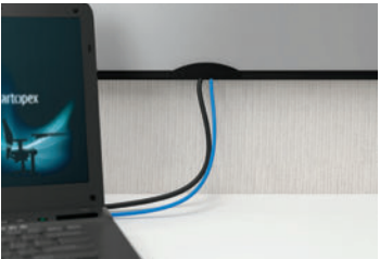
The Media panel provides easy access to electrical wiring and communications cables directly at surface height.