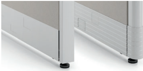
On the base of N7 series [square] or N2 series [rounded] panels, a raceway allows electrical cabling and communication wiring to run between work stations.

The Uni-T system offers outstanding ingenuity and flexibility. The vast array of storage units lets you to choose exactly what you need. Metal pedestals, open or closed shelving, Noki keyless locks – your priorities, your choice.