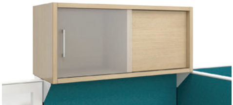
Shared storage with frosted sliding door.