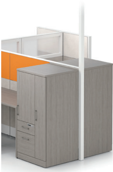
Cable pole runs cables between the base panel and the power source in the ceiling.