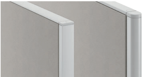
N7 series (square) or N2 series (rounded) connector covers.