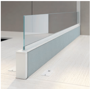
Clear glass privacy panels 8” or 16” H.