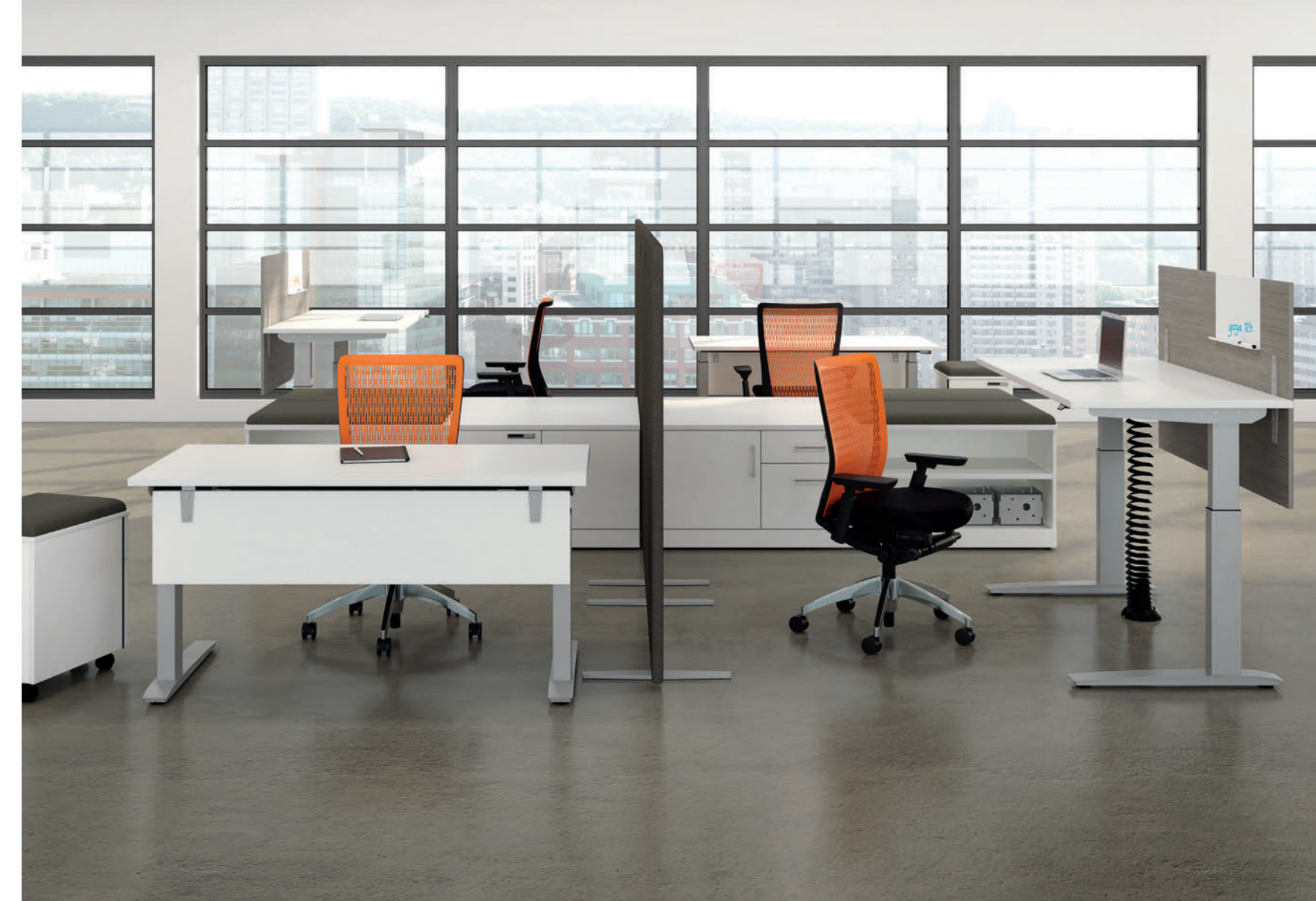
T shape leg