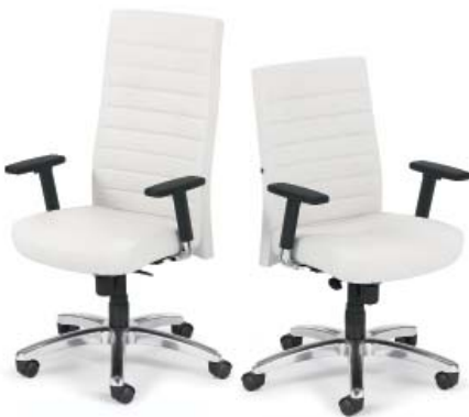
Seating Executive Task Guest