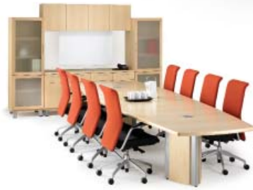
Conference furniture Tables and storage