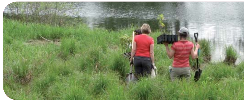
700 trees and shrubs were planted on the banks of various waterways