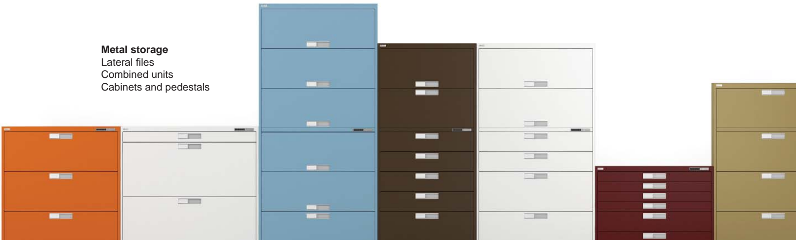
Metal storage Lateral files Combined units Cabinets and pedestals