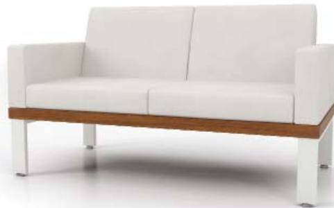
Lounge furniture Seating Side tables