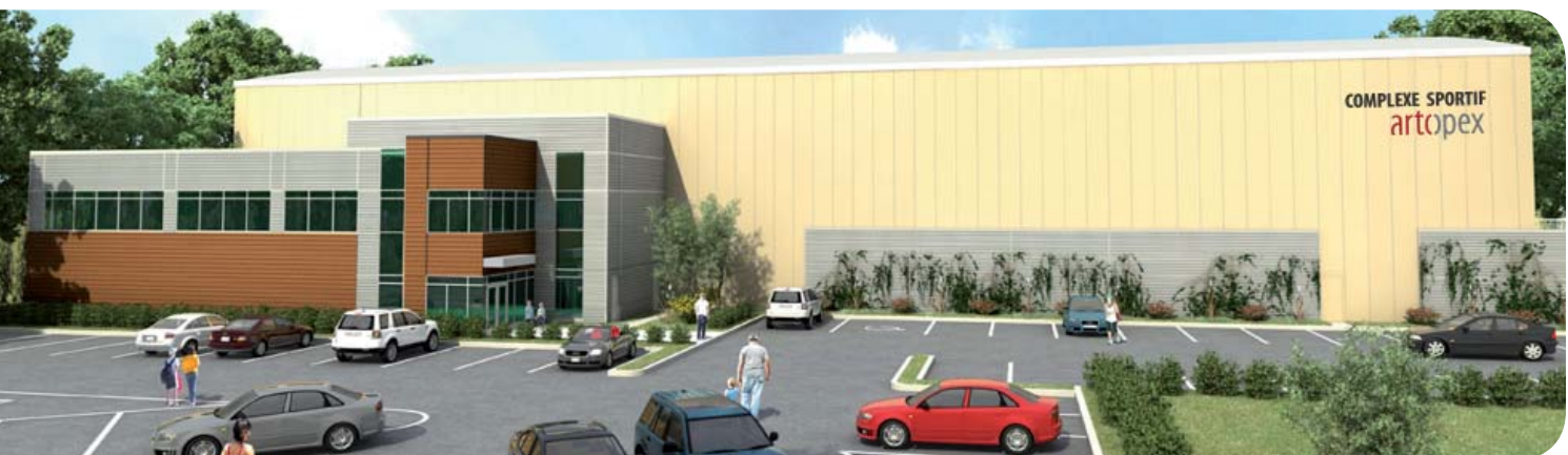
Artopex Sports Complex - Granby, Quebec