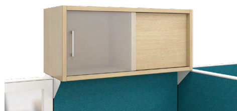
Shared storage with frosted sliding door.