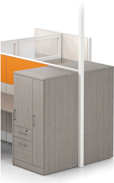
Cable pole runs cables between the base panel and the power source in the ceiling.